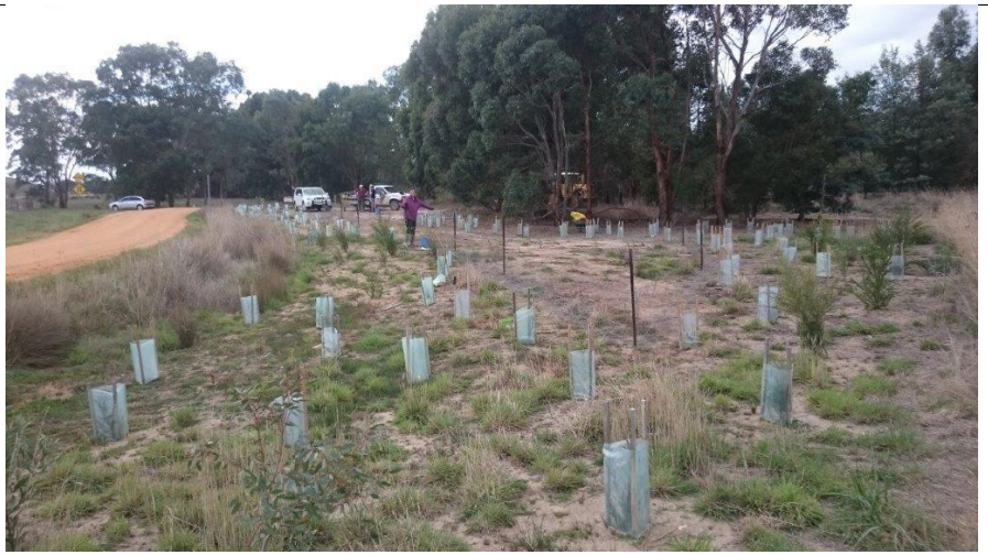
*Hardies Hill Road Water Reserve: BEN and GLG are working in partnership to develop a plan for this reserve.